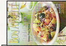
Bon Appétit 12 issues