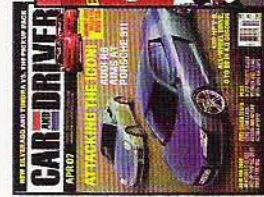
Car and Driver 24 issues