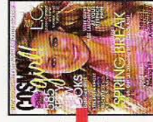
CosmoGirl! 10 issues