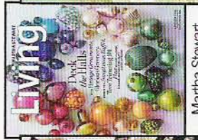
Martha Stewart Living 10 issues