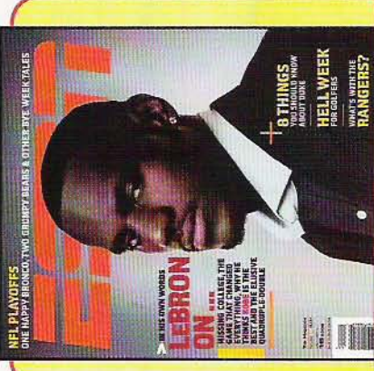
ESPN The Magazine 26 issues for just $20