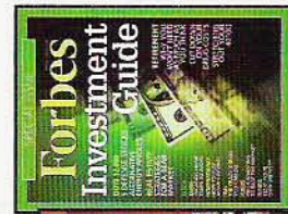
Forbes 26 issues