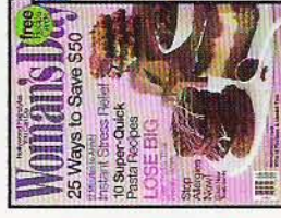
Woman's Day 34 issues