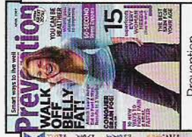
Prevention 14 issues