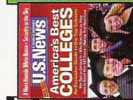
U.S. News & World Report 53 issues