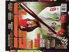
ESPN The Magazine 26 issues