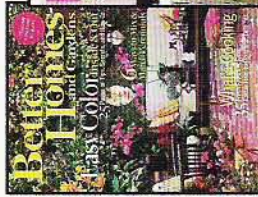
Better Homes & Gardens 24 issues

Purchase your favorite magazine(s), renew, or give them as gifts and we keep $12 from every subscription! 25 magazines for just $20 each!