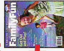
FamilyFun 10 issues