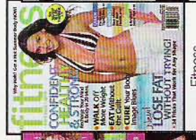
Fitness 24 issues