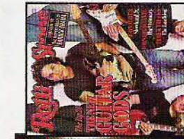
Rolling Stone 26 issues