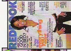
Redbook 24 issues