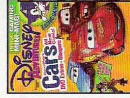
Disney Adventures 10 issues