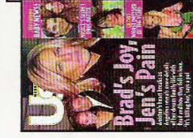
Us Weekly 20 issues