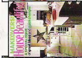
House Beautiful 20 issues