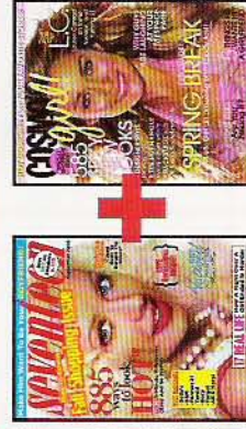
Seventeen 12 issues