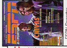
ESPN Deportes (Spanish) 11 issues