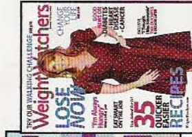
Weight Watchers 6 issues