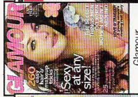
Glamour 12 issues