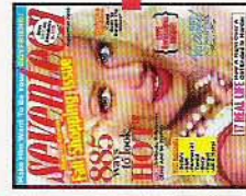
Seventeen 12 issues