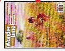
WonderTime 10 issues